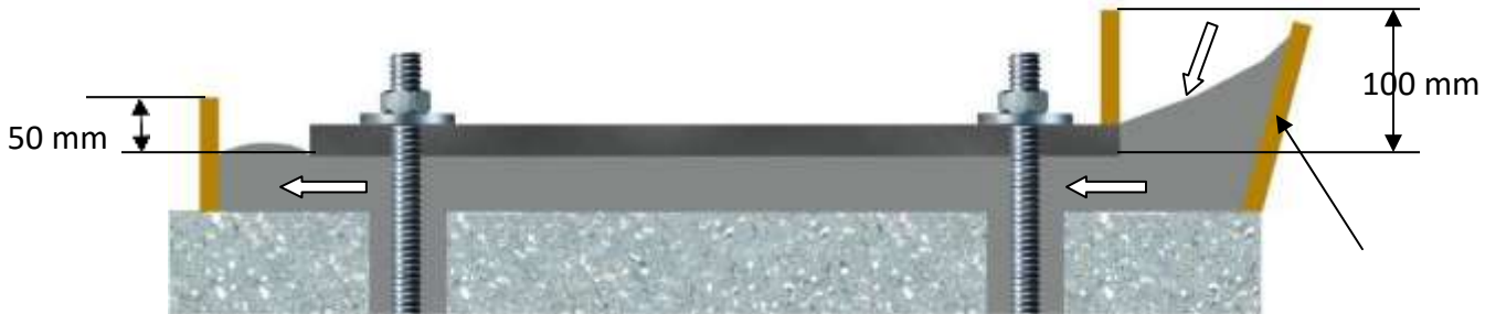
Feeding Hoppers system opposite the filling side Pouring side